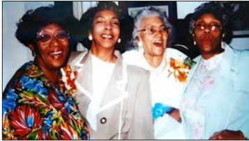
The Jean Moye Dark Fund for Black Women/Femmes + TGNC Artists